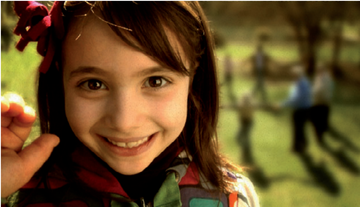
A photogram from the advert for the World Meeting

The VII World Meeting of Families is ready to enter the homes of the world. The official advert of the event has been created in 5 languages - Italian, English, French, Spanish and Portuguese. The advert starts from the archetypical, universal symbolism of the tree and tells of the importance of welcome and harmony as founding values of each family and, by extension, the Church, the global family par excellence. Men, women and children of all ages and origins will take part in a circle depicting a multi-ethnic, welcoming and harmonious world. All happy together while awaiting Pope Benedict XVI.