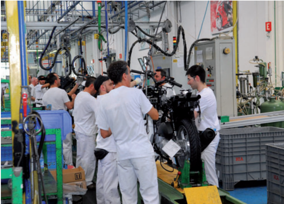
Labourers at work in a company

Companies meet families and open up to the area. This is what happens in ‘Company Open Days’, one of the initiatives proposed by the Diocese of Milan in preparation for the VII World Meeting of